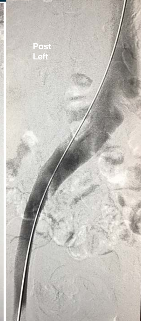
ZelanteDVT runtime 415 seconds Total case time 90 minutes

Images Courtesy of Charles Wyble M.D. – Vascular Surgical Associates, Marietta, Georgia–January 5, 2016