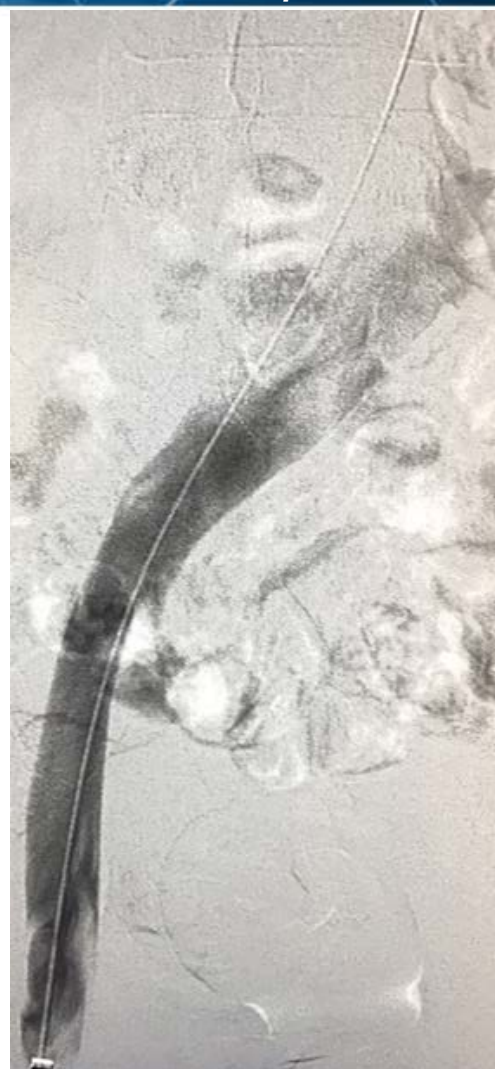
Power Pulse™ delivery 10mg tPA, followed by 20 minute dwell time