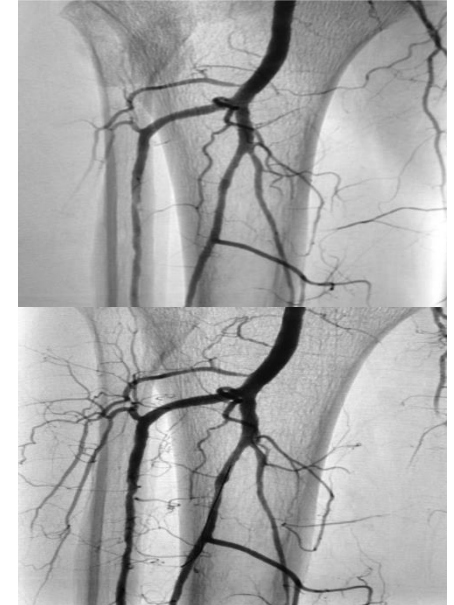
Pre and Post tibial flow

Results from case studies are not necessarily predictive of results in other cases. Results in other cases may vary.