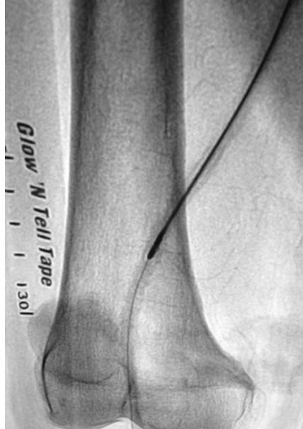
Jetstream™ Navitus™ Atherectomy

Popliteal lesion Patient was a claudicant